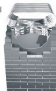
E-Z GRIP FASTENER ASSURES A TIGHT FIT ON STANDARD CHIMNEY FLUE SIZES